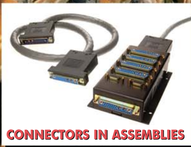
CONNECTORS IN ASSEMBLIES