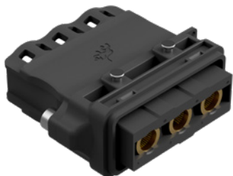
PANTHER II, Insulator materials: Liquid crystal polymer (LCP)

Both polymer materials enable the Panther to use a one-piece construction for the connector insulator. The trapezoidal design of the insulator provides polarization to prevent incorrect mating, and the one-piece design allows rapid assembly. Both members of the Panther family feature stainless steel fittings to provide a positive lock and deliver a secure connection, even under harsh conditions of vibration and shock.