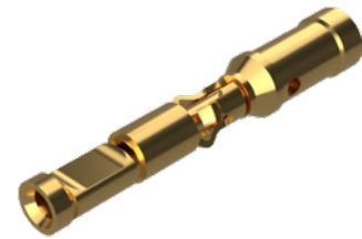
PosiBand closed entry

The machining process allows the creation of closed entry contacts. Traditional electrical contacts often use an open-entry design, with the mating part of the female contact featuring a split tine or bifurcated contact area. The split tine is vulnerable to mis-mating or foreign object damage, which can deform the contact. This damage has the effect of reducing the normal force that ensures a reliable contact, and can reduce its electrical performance, especially under harsh conditions.